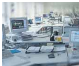
CAD Design/Development Department Customer-specific projects for rail and industrial applications