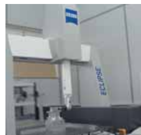
Computer-supported precision measurements. Continuous quality monitoring of all component developments