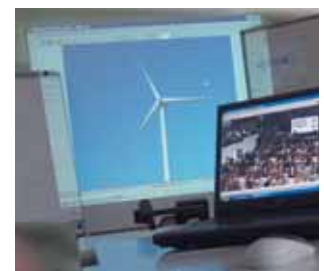
Communication worldwide. Utilization of advanced media. File transfer incl. CAD for Simultaneous Engineering