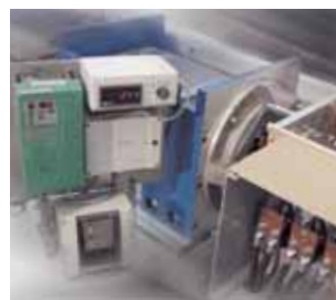
The system audits take place in Schunk's own test and laboratory facilities, as e. g. electricity and rpm test benches for earthing contacts and slip ring units.