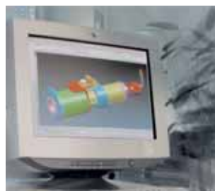
CAD/CAM/PLM developments can be given to our central manufacturing plant from different construction locations.