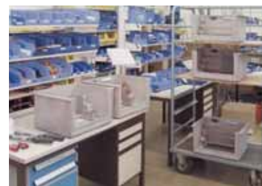
System installations take place using the latest manufacturing processes like KANBAN, among others.